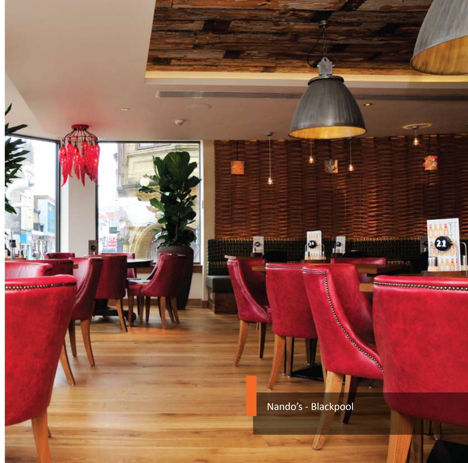
Nando's - Blackpool