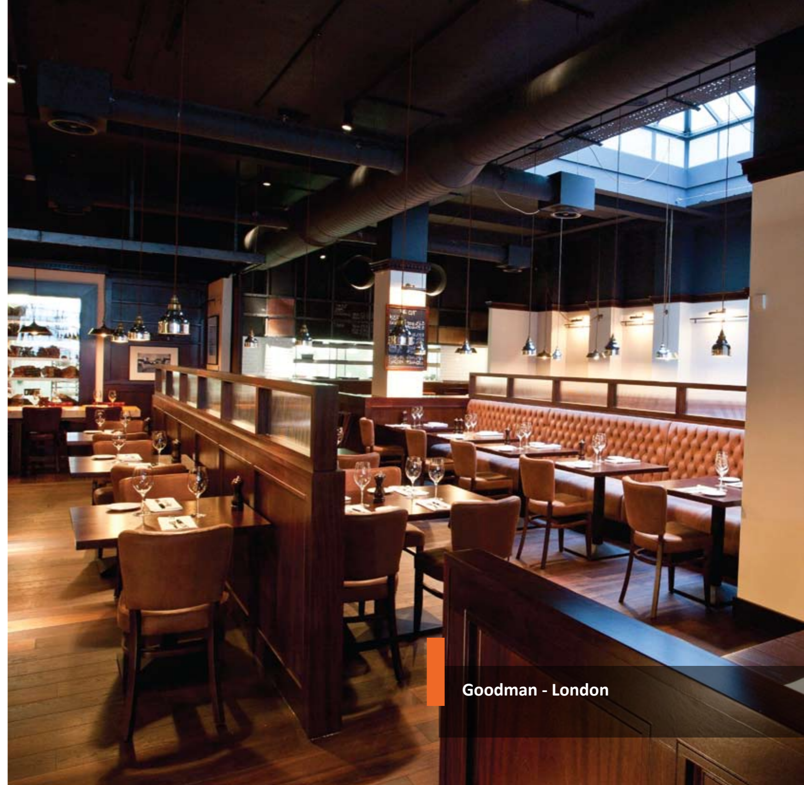
Goodman - London